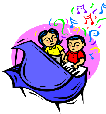
Caption describing picture or graphic.

Much of the content you put in your newsletter can also be used for your Web site. Microsoft Publisher offers a simple way to convert your newsletter to a Web publication. So,