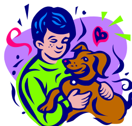
Caption describing picture or graphic.

Microsoft Publisher includes thousands of clip art images from which you can choose and import into your newsletter. There are also several tools you can use to draw shapes and symbols. Once you have chosen an image, place it close to