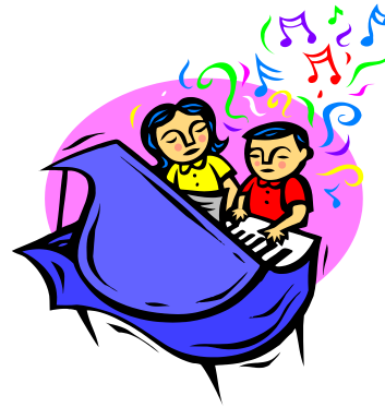
Caption describing picture or graphic.

Much of the content you put in your newsletter can also be used for your Web site. Microsoft Publisher offers a simple way to convert your newsletter to a Web publication. So,